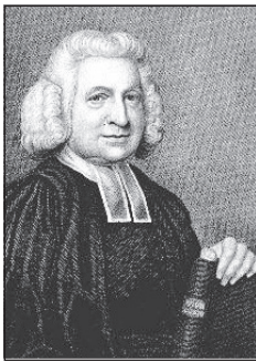
Charles Wesley (1707-1788)

TUNE http://www.hymntime.com/tch/mid/a/m/s/amsterdam.mid