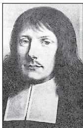
Joachim Neander (1650-1680)

http://www.hymntime.com/tch/mid/l/o/b/lobe_den_Herren.mid