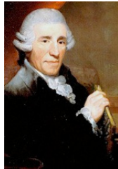
Franz J. Haydn (1732-1809)

Zion's king shall reign victorious, All the earth shall own His sway; He will make His kingdom glorious, He will reign through endless day. What though none on earth assist Him, God requires not help from man; What though all the world resist Him, God will realize His plan