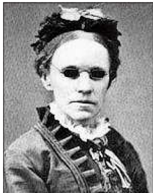
Words by Fanny Crosby (1820-1915)